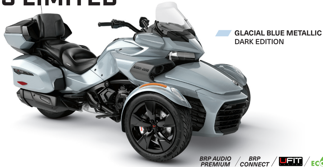
SPYDER F3 LIMITED